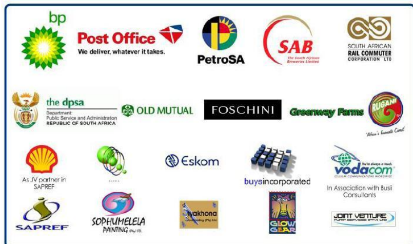
Above - Sample list of Pétanque clients who they are working with on Project Management Methodology

Pétanque (the business) uses the principles of the game by the same name: they apply the right tools (the boules), design the tactics (the loop, lob, ctank), focus on the target (the jack) and achieve the victory (score the points) whilst aligning to the bigger picture (in boules the bigger picture is to have fun in a competitive, team structure).